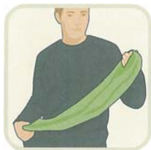
Fold the scarf in half.