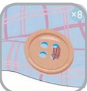
Sew, but not too tightly.