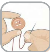
Attach the button.