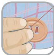
Repeat on the other holes.