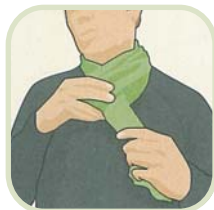
Bring through the loop.